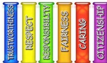
The Six Pillars of Character