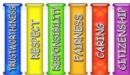
The Six Pillars of Character