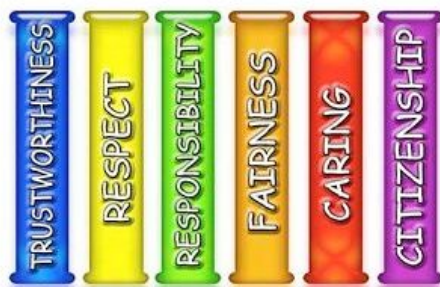
The Six Pillars of Character