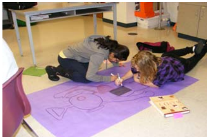
Students working on the Muscle Action Figure in Science

As one walks through the halls of Westfield you see Wonder Woman, The Pillsbury Dough Boy, Ferb, Peter Pan and many other characters from literature, TV, or sports. All of the science classes incorporated their knowledge of 17 specific muscles of the human body and drew the characters half clothed, and half with exposed muscles. When determining the angles of the muscle strand fibers, the students contorted their own bodies to match their characters and then identify the muscles. As always, every student is proud to see their hard work displayed for all to see.