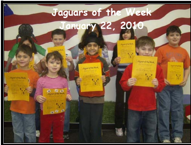
Jaguars of the Week January 22, 2010